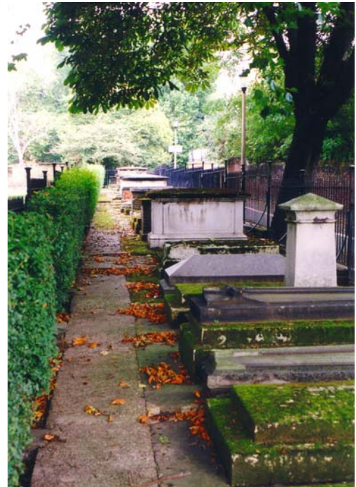
Fine old Georgian tombstones, which include those of the Beaufort family (Inventors of the Beaufort Scale), many Huguenot families and the Loddiges (who owned one of the largest hot houses of its time).

The study team consulted not only the church authorities, council officers and other agencies, but also held meetings and workshops with local people with an interest in the future of the churchyard. Suggestions were made by local residents, school children and business people for improving the fabric of the churchyard through local action groups, installing better night-time lighting, establishing a small café and creating a wildlife garden.