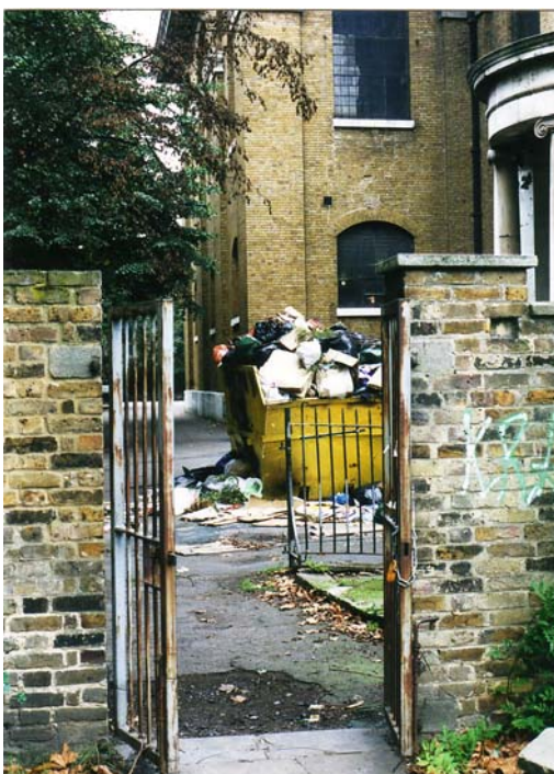
Damage, graffiti and inappropriate uses of the spaces