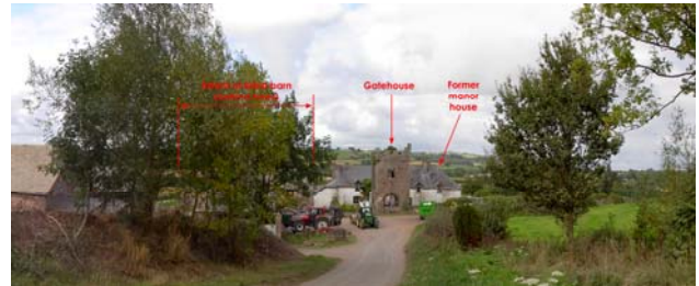
View of the Great Porthamel gatehouse and former manor house

The manor house of Great Porthamel was founded in the late 15 th century by Sir William Vaughan, the first sheriff of Breconshire. It was built in the rich agricultural lowland of the Wye valley and was unusual in being protected by a fortified precinct with a tower gatehouse. In the 16th century, the manor was surrounded by a deer park which can be seen on several maps of the early 17th century.