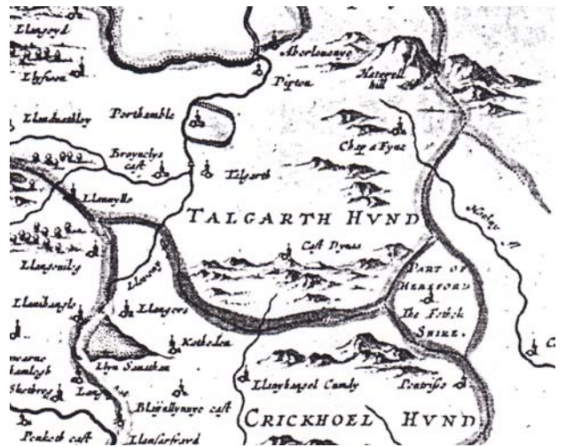
Detail of map by John Blaeu dated 1645 showing a park around Great Porthamel

Great Porthamel is working farm. In addition to arable farming, the business also accepts and composts slurry waste from other farms. In 2009, in response to EC waste management initiatives, the farm applied for planning consent to install an anaerobic digester complex close to the existing farm buildings. This gave rise to concerns about the potential impact of the new installation on the setting of the three listed buildings and consent was refused.