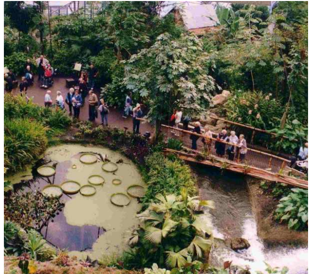
Interior of the Tropical Biome