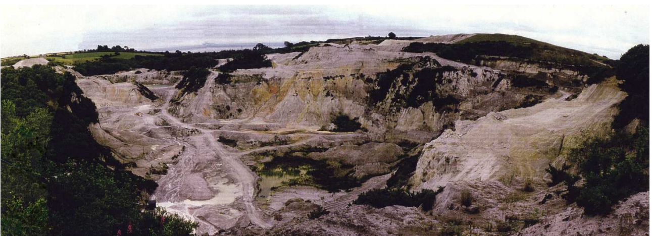
The Bodelva Pit when it was bought in 2006