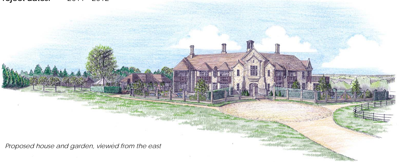
Proposed house and garden, viewed from the east

Occupying the site of the former Charlton House (demolished in the 1950s) a new country house is to be built at Kilmersdon in Somerset. The house is designed in a traditional style strongly influenced by the Arts and Crafts design movement. The garden has been designed to complement this style. It will have a hierarchy of spaces, with formal gardens arranged immediately around the house. These will be separated from the wider parkland by iron railings and a cattle grid on the main drive. The historic entrance gate to Charlton Court is to be dismantled, repaired and re-erected.