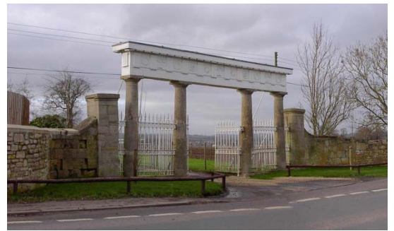
19 th century entrance gate to Charlton Court

Occupying the site of the former Charlton House (demolished in the 1950s) a new country house is to be built at Kilmersdon in Somerset. The house is designed in a traditional style strongly influenced by the Arts and Crafts design movement. The garden has been designed to complement this style. It will have a hierarchy of spaces, with formal gardens arranged immediately around the house. These will be separated from the wider parkland by iron railings and a cattle grid on the main drive. The historic entrance gate to Charlton Court is to be dismantled, repaired and re-erected.